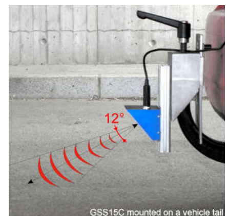
GSS15C mounted on a vehicle tail

The digital frequency and analogue speed output are electrically isolated from the power section of the sensor and offer an easy connection to most data acquisition units. The speed and distance information is also available on the sensor's RS232 interface for linking it to a mobile computer by an optional SB2 or SB2-USB inter-