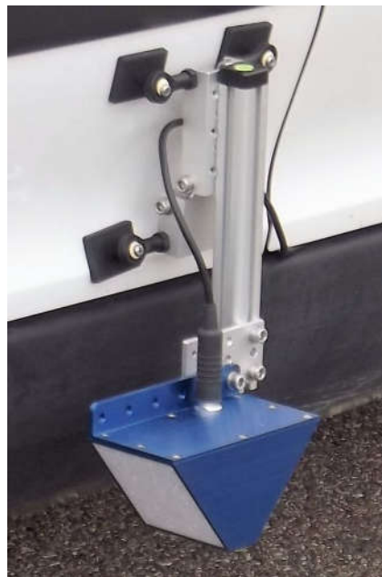
GSS25C with magnetic holder on the side of a van

connection box that comes with BNC sockets for speed pulses, analogue speed output and the direction signal.