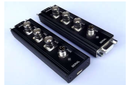
SB2 and SB2-USB Interconnection Box

The Windows based PEGAVIEW evaluation software can display a graphical speed curve and record distance travelled from the sensor's serial data interface.